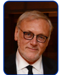
Geza Banfai McMillan LLP

MCAC Change Order Protocol will protect trade contractors from risks associated with managing the change process. Providing a fair and reasonable process for the costing and pricing of changes for all industry project stakeholders. Changes to the scope of the project are inevitable. The scale and number of changes significantly impacts productivity, costs and profitability. If handled improperly changes lead to disputes or litigation. Protect yourself by adopting the MCAC Change Order Protocol in your next contract.